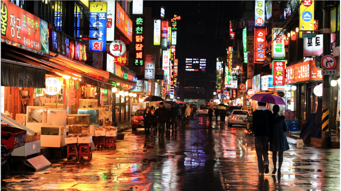
Image 1: Seoul is the capital of South Korea. It is also the country's most populated city. Seoul hosted the 1988 Olympic Games.

Korea is a country in East Asia. It sits on a 750-mile-long stretch of land. It sticks out into the sea. Today, Korea is split into two parts: South and North Korea.